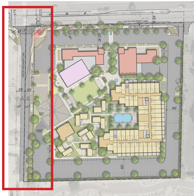
N KEY MAP - NOT TO SCALE