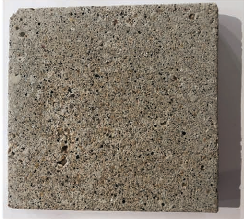
1.11 (1.12, 1.60, 1.61) PATIO PAVING PER ARCHITECT. SET ON CONCRETE. ANCIENT STONE LIMESTONE ETCH, COLOR A-22. (LRV: 28%)