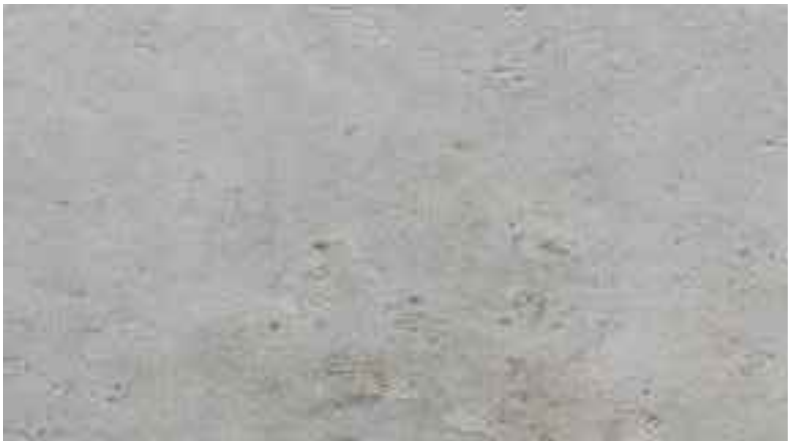
STONE SILLS/LEDGE JERUSALEM GREY/GOLD SMOOTH LIMESTONE, LRV 29.36