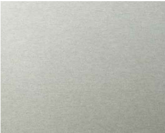
WINDOWS/DOORS WESTERN SATIN ANODIZED, LRV 18