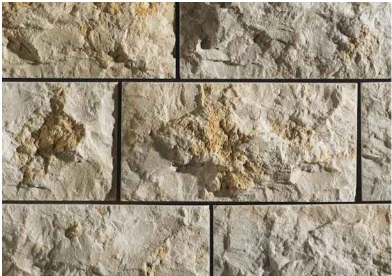
STONE @ TOWERS JERUSALEM GREY/GOLD SPLITFACE LIMESTONE, LRV 29.36