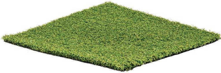
5.11 PUTTING GREEN. SPEC: 'PUTTING GREEN', PIONEER SAND COMPANY, OR EQUIVALENT. CONTRACTOR TO PROVIDE SAMPLES ONSITE FOR OWNER APPROVAL PRIOR TO PURCHASE OR INSTALLATION.

NOTE: ALL MATERIALS TO MEET TOWN OF PARADISE VALLEY HILLSIDE LRV REQUIREMENTS. MAX 38%.