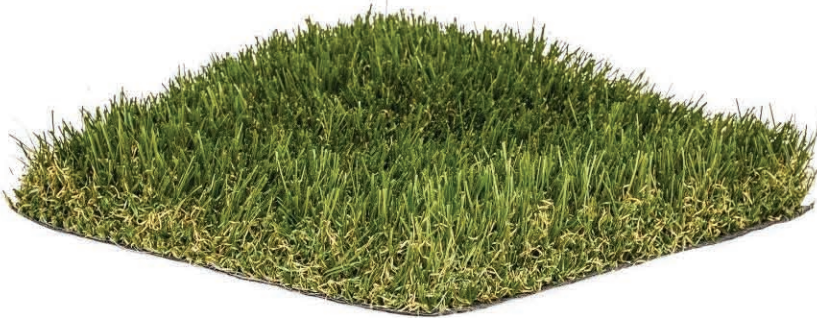
5.10 SYNTHETIC TURF. SPEC: 'DARBY', PIONEER SAND COMPANY, OR EQUIVALENT. CONTRACTOR TO PROVIDE SAMPLES ONSITE FOR OWNER APPROVAL PRIOR TO PURCHASE OR INSTALLATION.