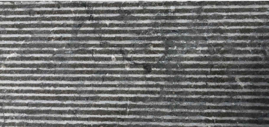
STONE FIN WALL PAMPLONA NOVO, WIDE COMB FINISH FROM SOLSTICE STONE, LRV 21.85