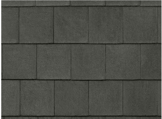
ROOF TILE BORAL STONE MOUNTAIN DARK ROOF FLAT CONCRETE TILE, LRV 13