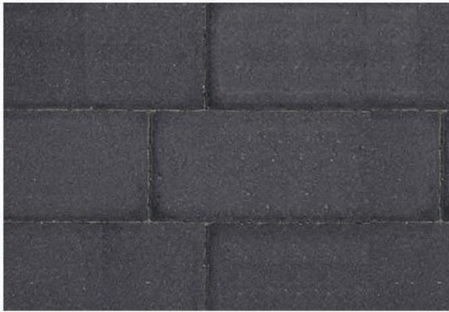
1.10 NEW DRIVEWAY PAVERS. BELGARD MODULINE SERIES, 3" x 12" 'GRAPHITE' COLOR. RUNNING BOND PATTERN, SAND SET. (LRV:15%)