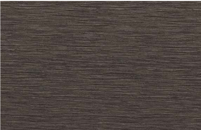
COMPOSITE WOOD GEOLAM QUALITA COLOR TO BE EBONY, LRV 15