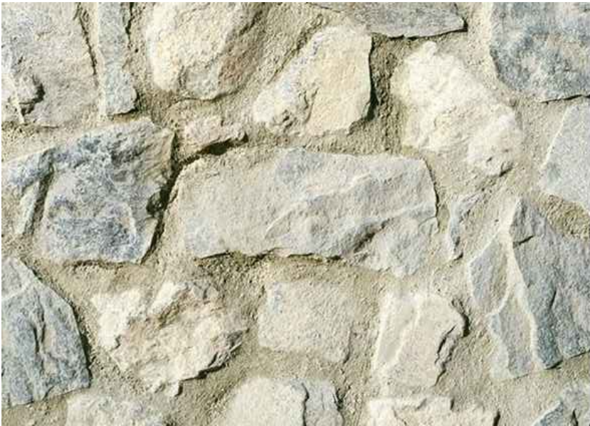
STONE DC RANCH COBBLE STONE, With MORTAR WASH, LRV 18.18, GROUT TO BE AMERAMIX BROWN WITH MADISON GOLD QUARTER MINUS THROWN AT IT