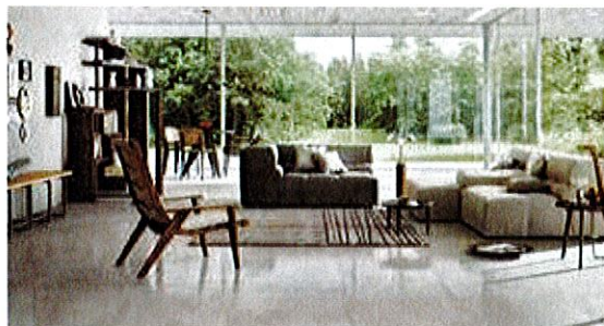
Pietra Italia Grey 24 x 24