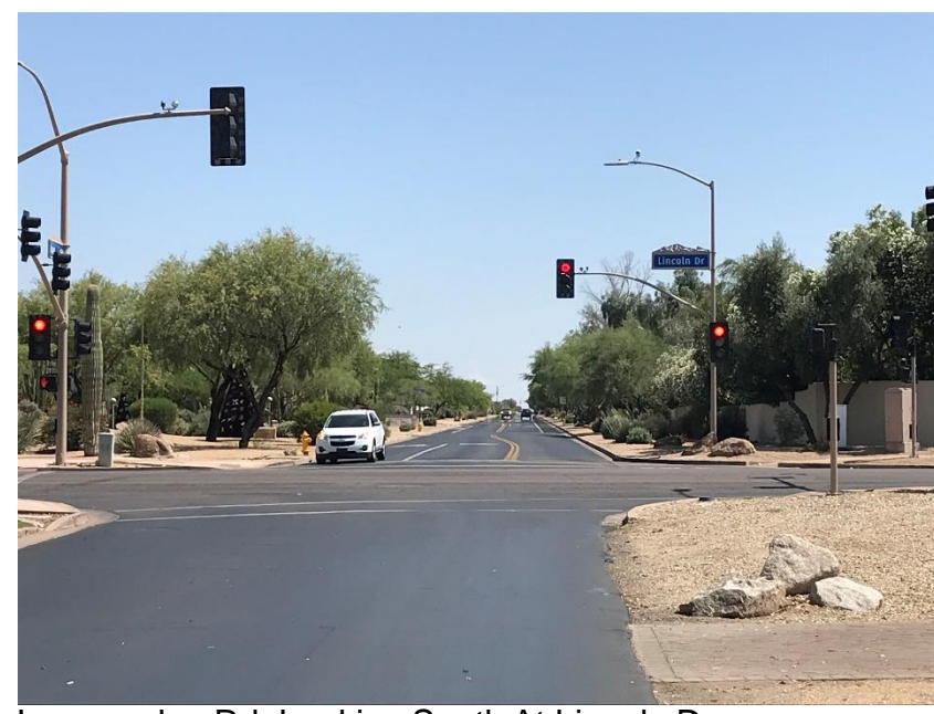
Invergordon Rd. Looking South At Lincoln Dr.