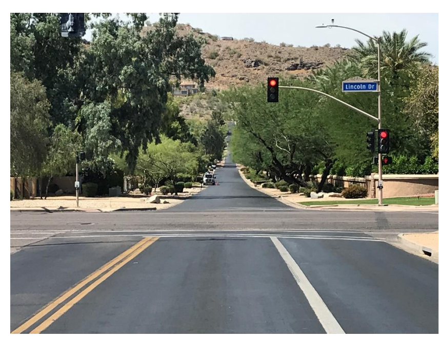
Invergordon Rd. Looking North At Lincoln Dr.