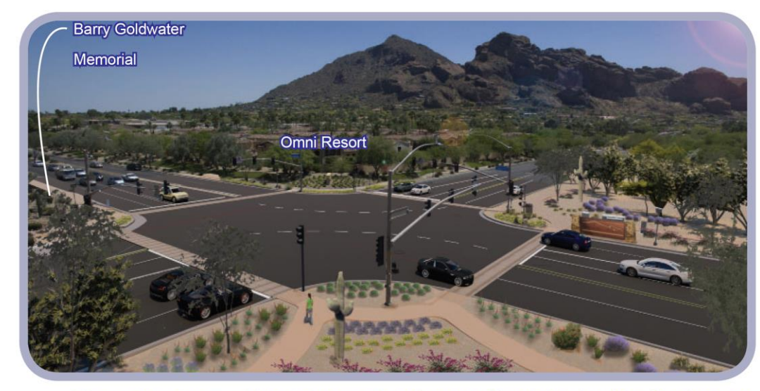
Figure 2.3: Tatum + Lincoln Intersection Concept Simulation Looking Southeast to Camelback Mountain