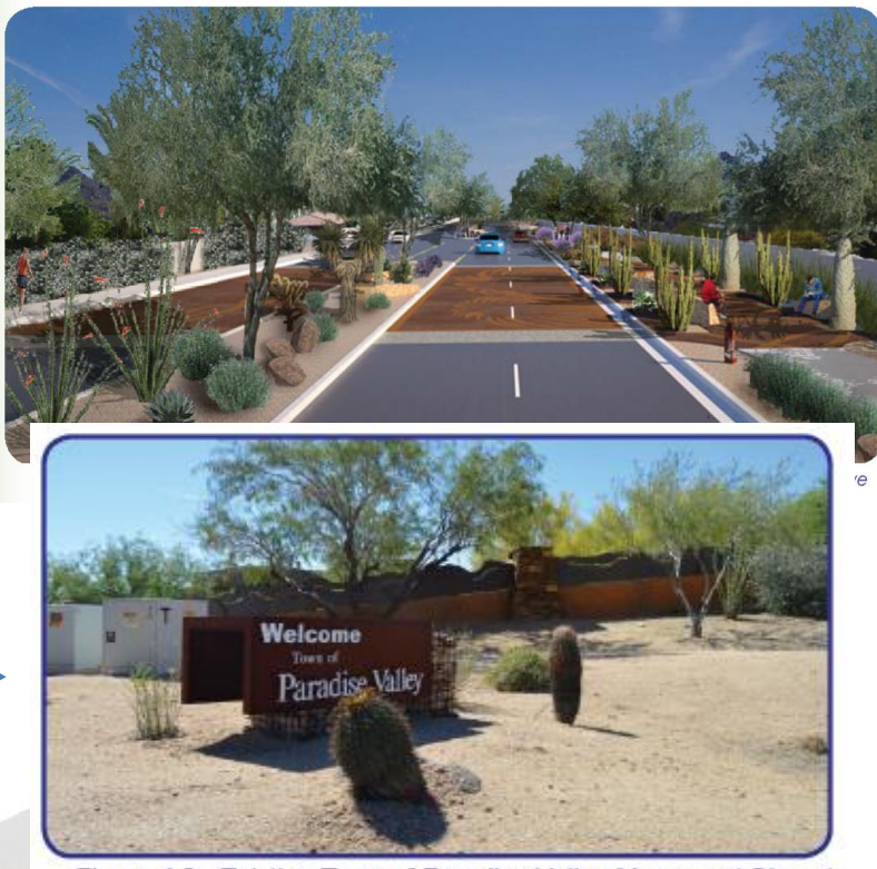
Figure 4.3: Existing Town of Paradise Valley Monument Sign at 32nd Street and Lincoln Drive

Figure 4.9: Saguaro Cactus Themed Entry Monument Sign Conceptual Design