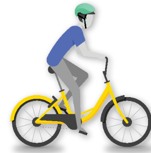
GO! SIMPLY LOCK THE BIKE TO END YOUR TRIP