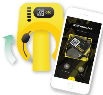
UNLOCK A NEARBY BIKE, AFTER LOCATING IT THROUGH THE APP