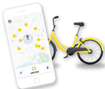
DOWNLOAD THE ofo APP