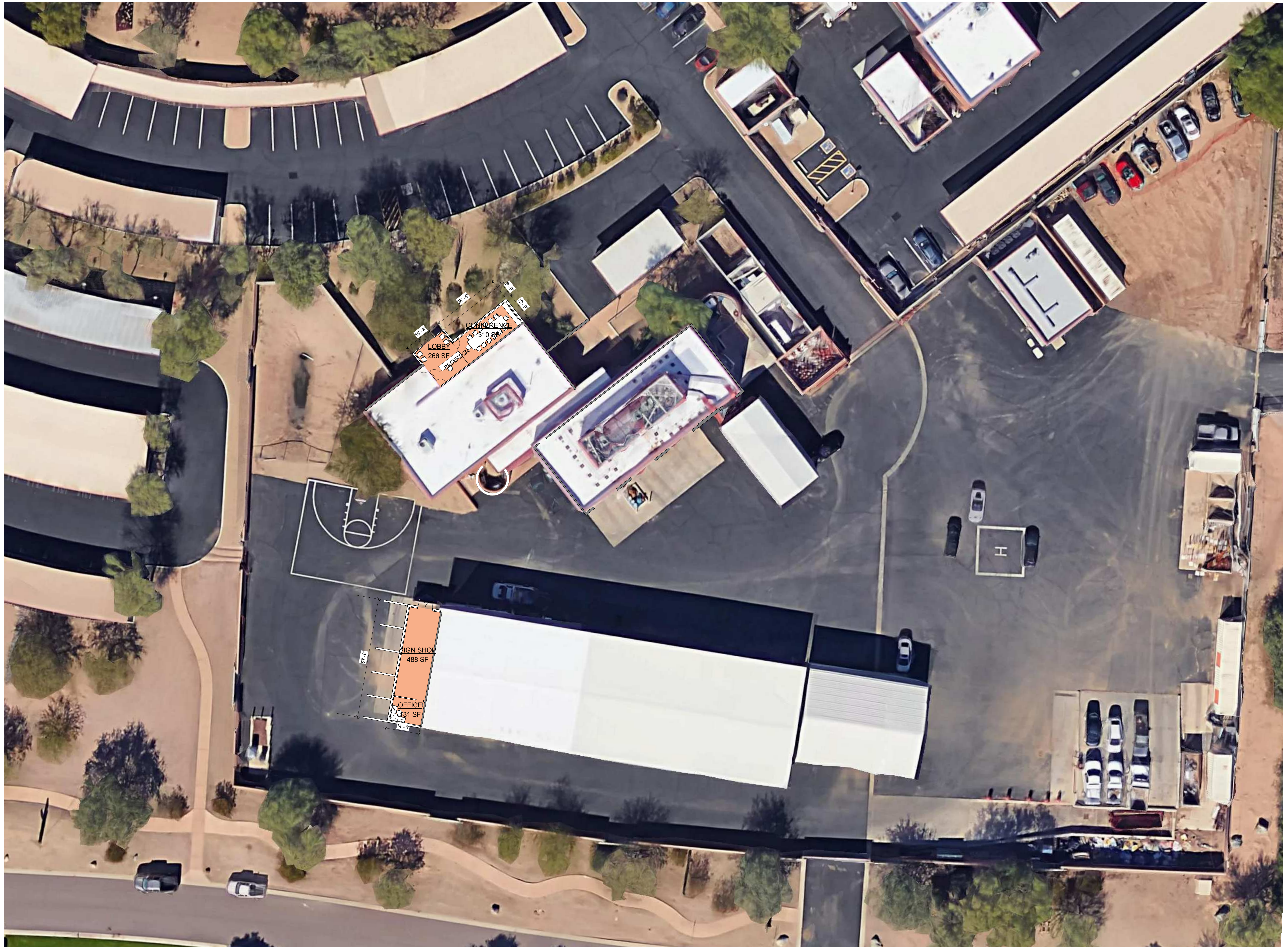
SITE PLAN - PUBLIC WORKS