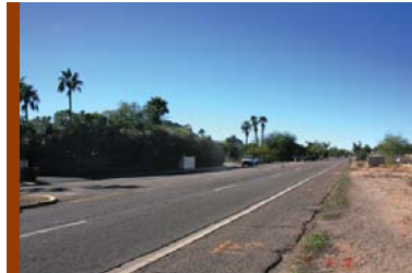
Existing Lincoln Drive

A design charrette is a process for collaborative problem solving and decision-making during a multi-day design event that develops the community's ideas into graphic concepts and design alternatives. Community participation is requested at the Monday and Wednesday evening sessions. You may also drop by during the day on Tuesday and Wednesday.