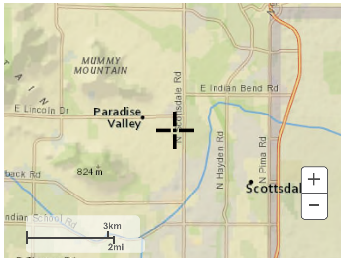
Large scale terrain