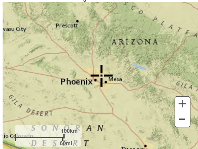
Large scale map