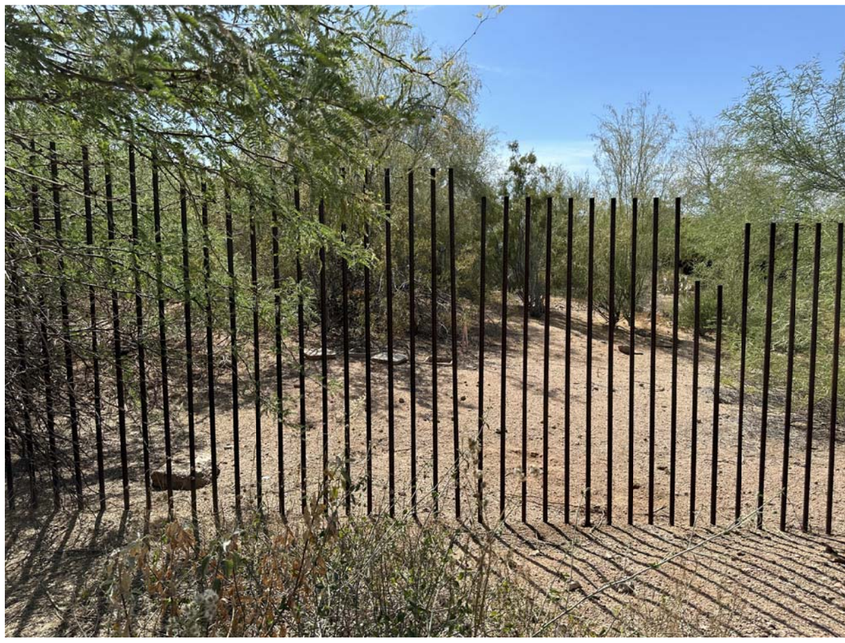
EXISTING FENCE VIEW A