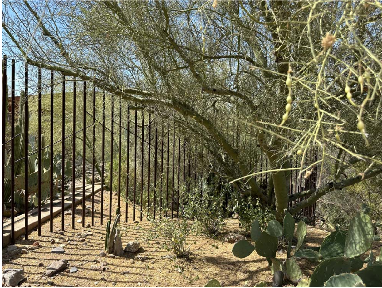
EXISTING FENCE VIEW B

TIE IN TO EXISTING POOL BARRIER FENCE / GATE