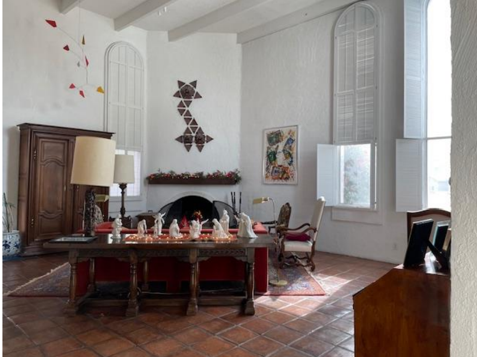
View of living room with high arched windows