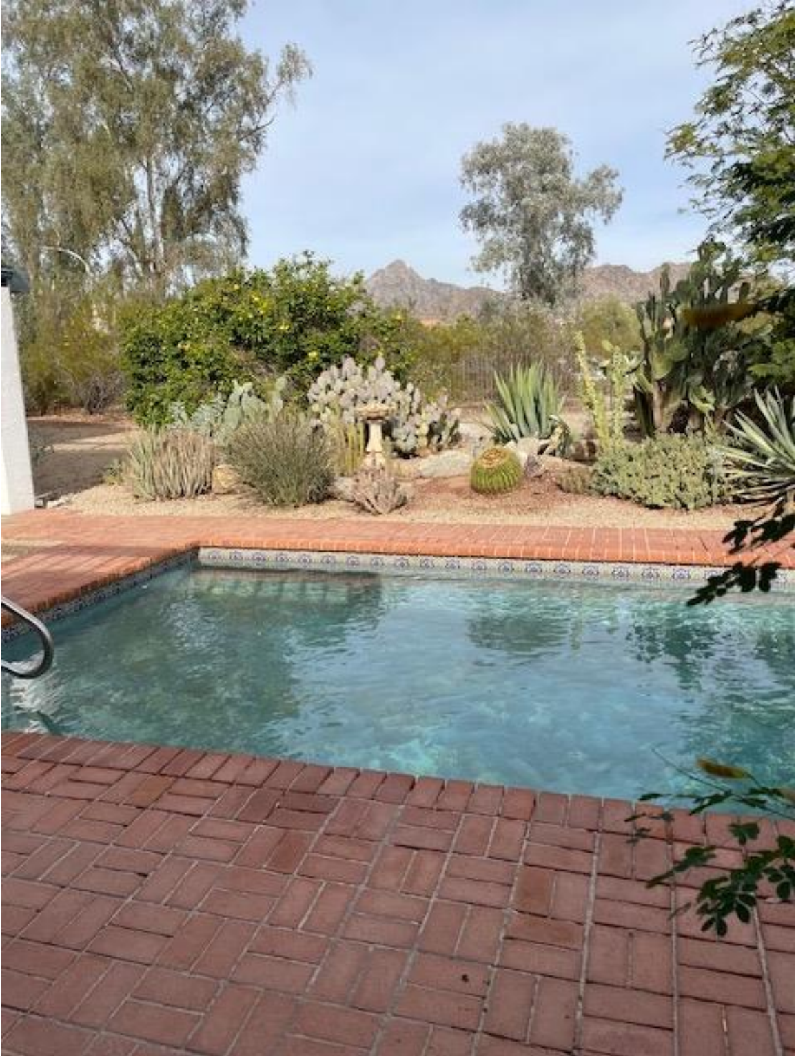
Backyard with view of Piestewa Peak