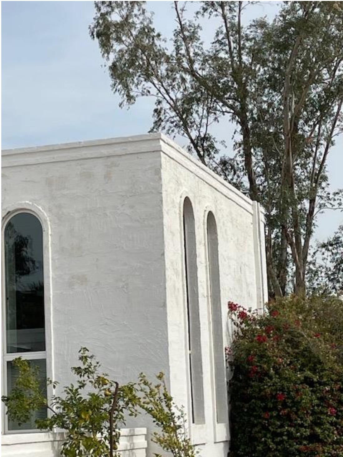
Front of 3228 E. San Miguel Place