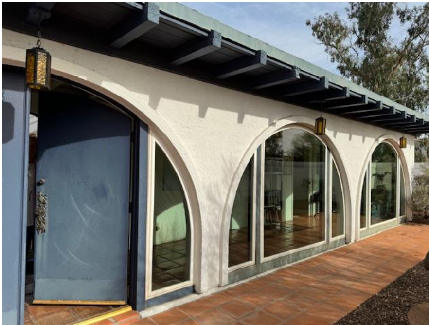
View from courtyard of front door and hall of arched windows