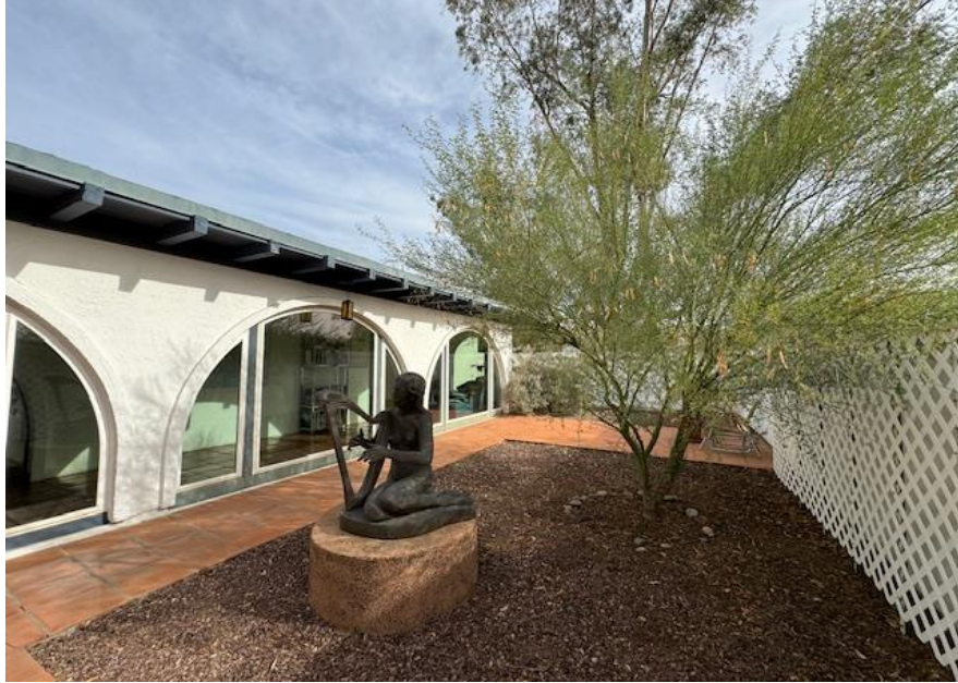
Front courtyard with statue designed by Waddell