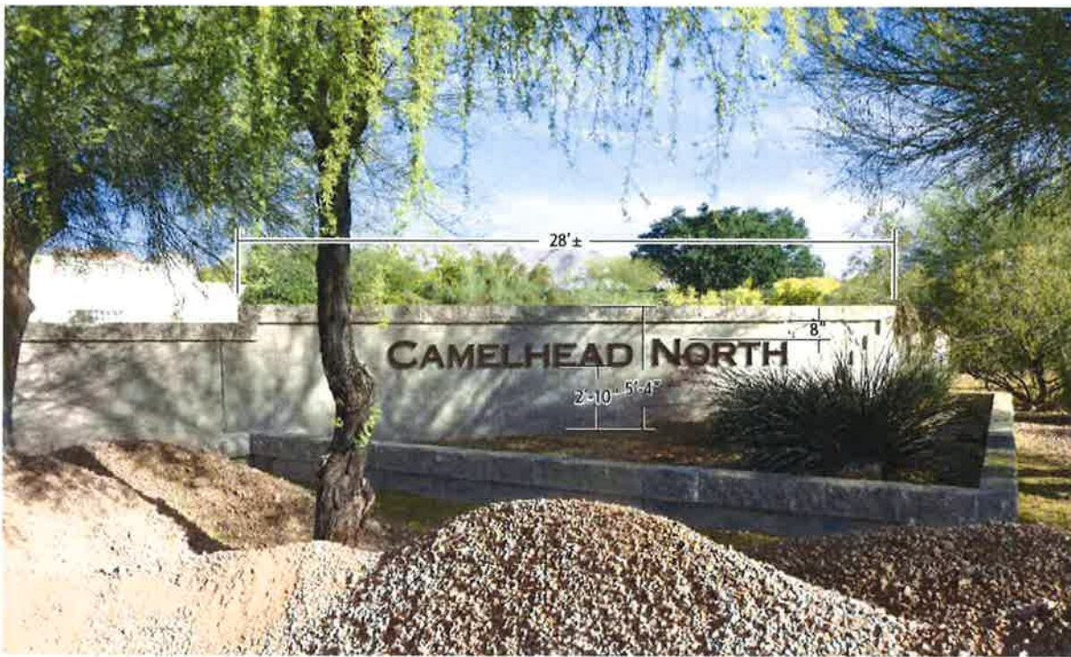
Northwest corner of Tatum Boulevard and Arroyo Verde Drive