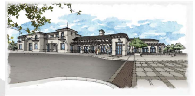
October 11 th , 2018