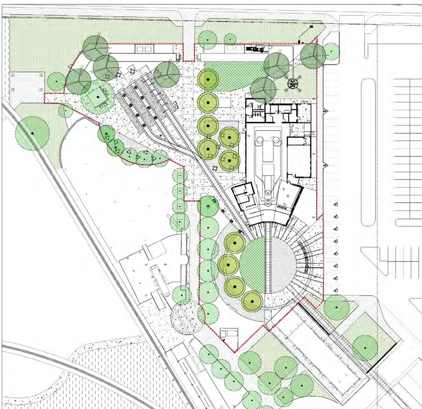
MCCORMICK STILLMAN RAILROAD PARK LANDSCAPE ARCHITECTURAL SITE PLAN NORTH SCALE 0 20' 40' 60' 1"=20'-0"