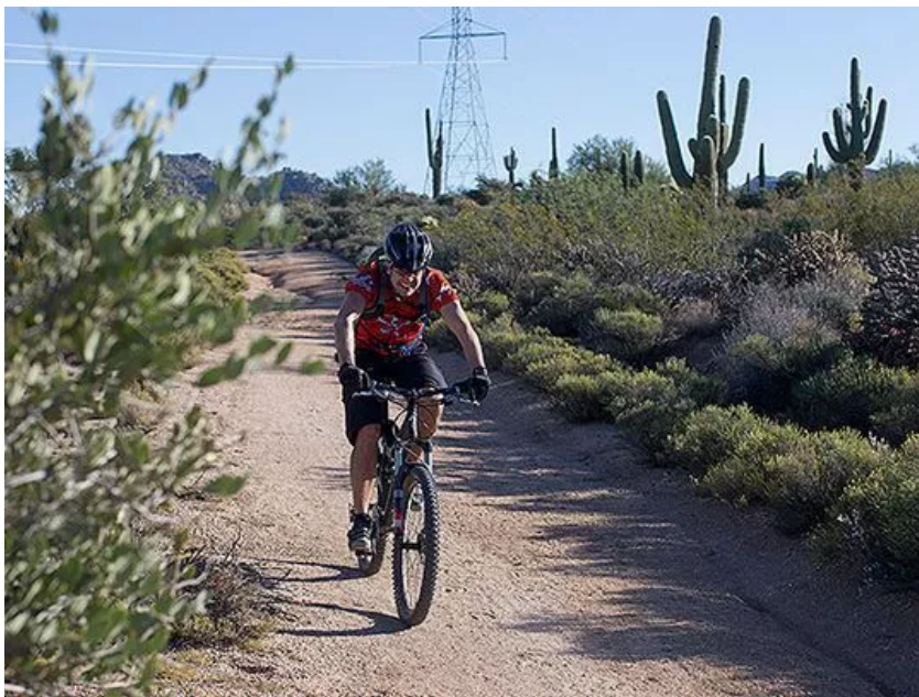
The Republic made a list of its favorite biking spots in Scottsdale

On Jan. 18, the Scottsdale Transportation Commission held an informational meeting about bike-share providers that included comments from residents.