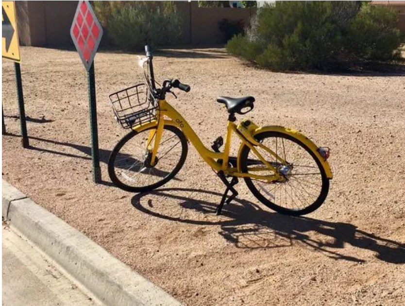
This ofo bike was left parked at 84th Street just north of Cactus Road in Scottsdale.

Phoenix Councilman Sal DiCiccio recently recommended in a now-deleted Facebook post that Arcadia homeowners throw offending bikes in the trash. On Jan. 22, DiCiccio's office met with ofo and both parties said they will continue discussions to make sure bikes are parked properly and don't interfere with pedestrians or private property.