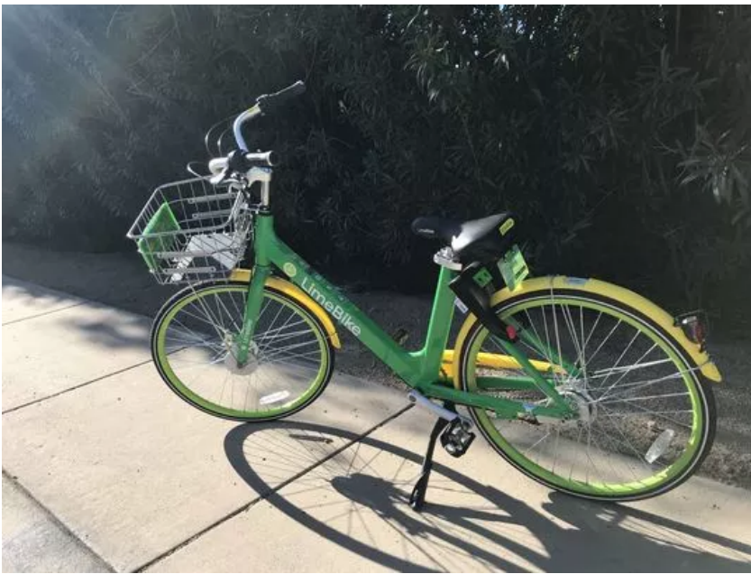
A LimeBike is seen parked in Phoenix's Arcadia neighborhood on Jan. 19, 2018.

Dockless bikes can be left at public bike racks or curbside away from buildings. Don't park them at bus stops, on private property or street corners or lay them on the ground.