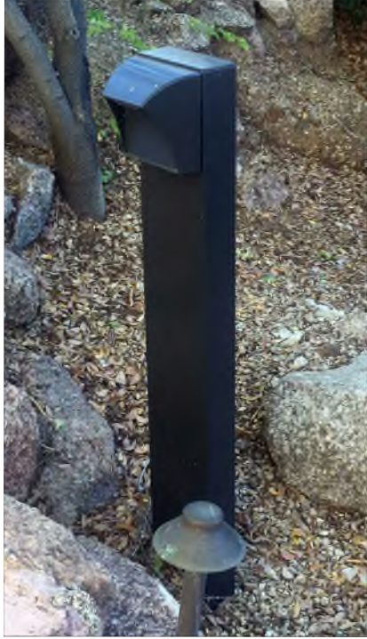
EXISTING STEP LIGHTING TO BE RELOCATED IF NECESSARY

NEW STRUCTURES WILL NOT BE ILLUMINATED BY EXTERNAL SITE LIGHTING. THE ONLY EXTERIOR LIGHTING TO BE AT ENTRY/EGRESS DOORS AS REQUIRED, TO MATCH EXISTING LIGHTING AND COMPLIANT WITH DARK SKY ORDINANCES. PATHWAY AND GROUND LANDSCAPE LIGHTING WILL BE RELOCATED ONLY WHEN NECESSARY. ADDITIONAL PATH LIGHTING IS NOT ANTICIPATED.