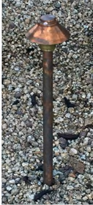
EXISTING PATH LIGHTING TO BE RELOCATED IF NECESSARY