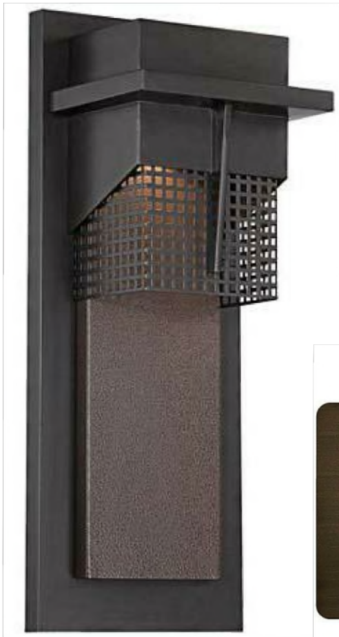
ENTRY DOOR SCNCE BEACON 8Y617 LED WALL LIGHT 15.5" H W/ MESH DIFFUSER SHIELD DARK SKY COMPLIANT 10W, 340 LUMENS TOTAL 91 AT INTERSTITIAL UNITS & SNACK BAR, TOTAL 5 AT VIEWS