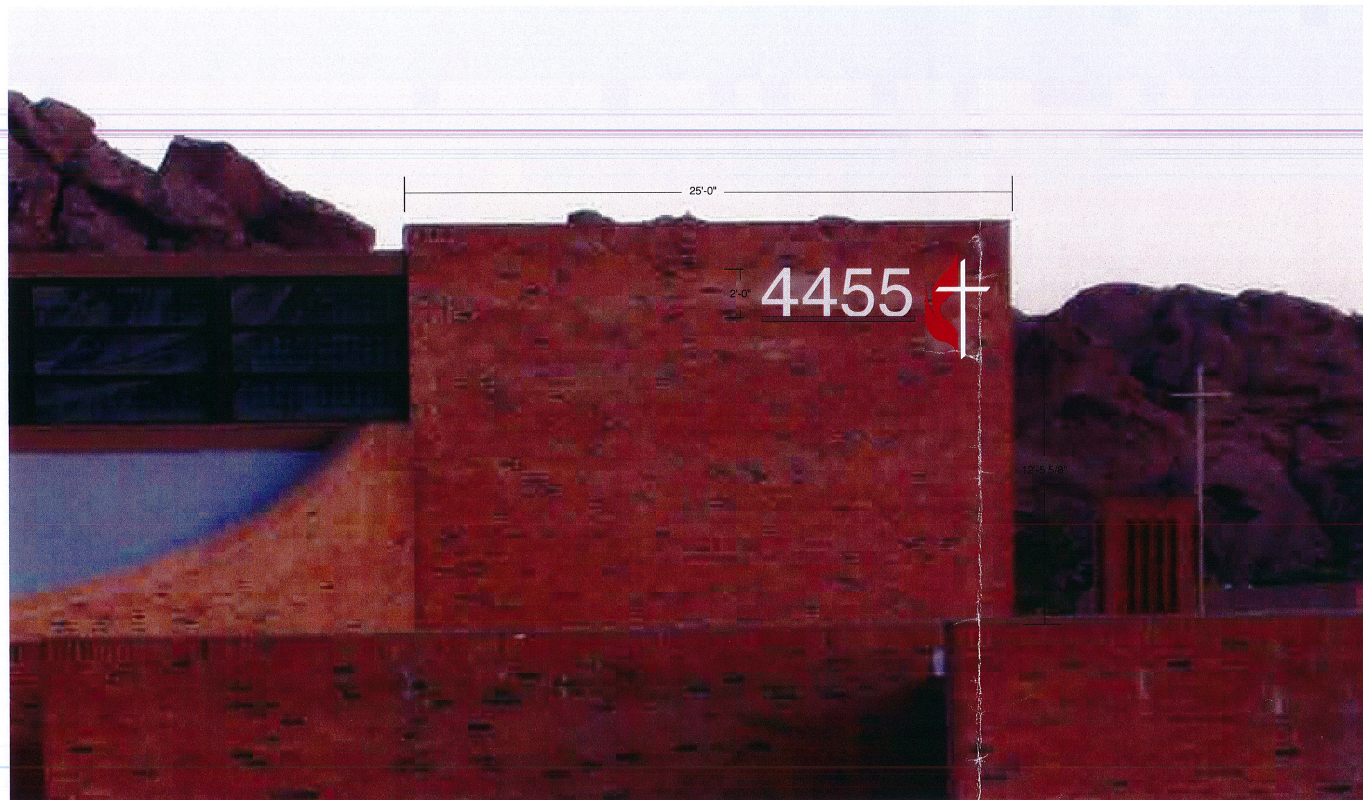
address | elevation | scale: 3/16" = 1'-0"

- Methodist cross is a 3" thick Halo Illuminated RPC, mounted 1 1/2" off the wall.